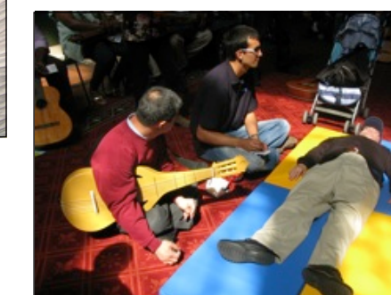
Co-assisting with 'musical mattress' design