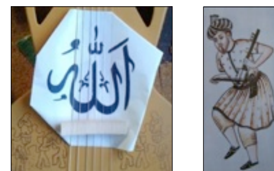
'Allah' calligraphy design for body