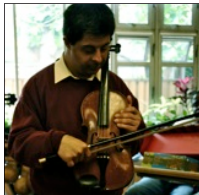
Exploring bowing a violin